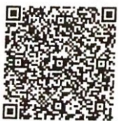
Registrar Pharmacy Council